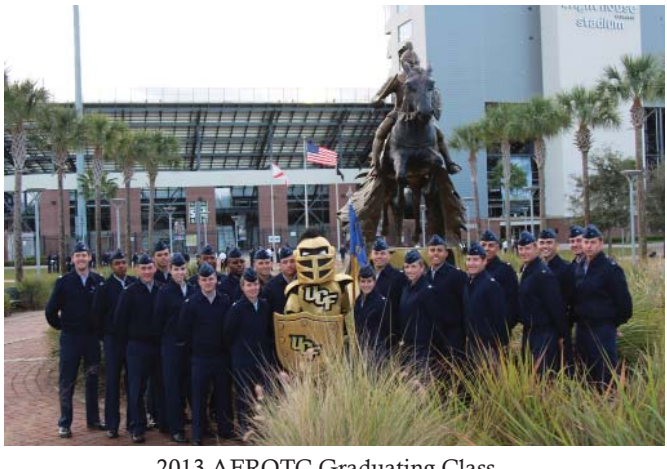
2013 AFROTC Graduating Class set for Commissioning on May 5th.

all of the Florida AF- ROTC detachments plus Det 172 cadets from Valdosta State University in Georgia (they're "almost" Florida). Although the Flying Knights did not bring home the cup this year, we'll be hosting LIME CUP in 2014 so we'll have homefield advantage.