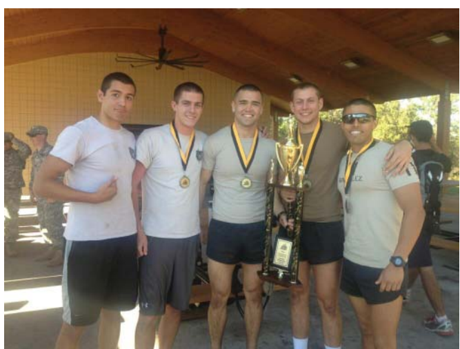
2013 UCF Iron Knight Winners

Thank you to the Central Florida Chapter of the AFA for your tremendous support of Detachment 159. We hope you will join us side-by-side as we dedicate the new building.