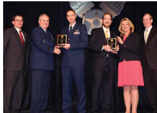
ACC/A3 and Georgia Tech Research Institute recipients