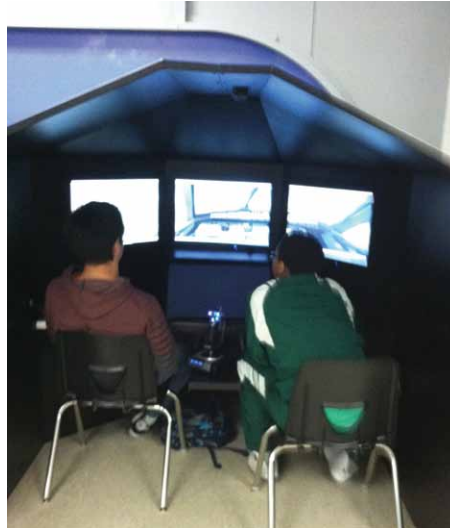
Oak Ridge High School Aviation Magnet Simulator