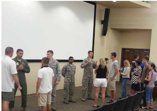
UCF AFROTC Det 159 Cadets share during Q & A time

This event is held each year on the first Sunday of the Air Force Academy Spring Break. This timing allows current USAFA cadets, from the Central Florida area, to join-up with AFROTC cadets from