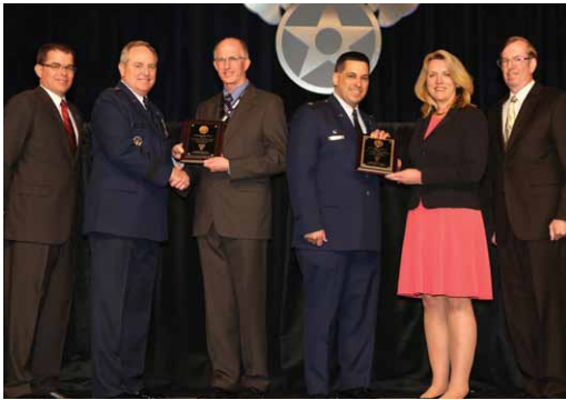
Alpha Omega Change Engineering and the 705th Combat Training Squadron

The final award of the evening was presented to the Combat Air Force Weapons and Tactics Conference for their orchestration of the 2014 conference, which centered on finding innovative ways to use existing technology to accomplish Air Combat Command's five core functions: air superiority; global