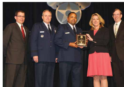
CAF Weapons and Tactics Conference

against a more realistic threat. The team was represented by the Georgia Tech Research Institute and ACC/A3.