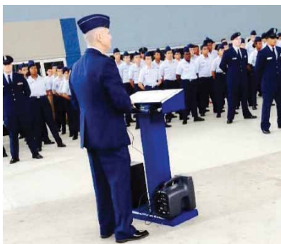
Dr. Phillips AFJROTC Pearl Harbor Day Remembrance

The structure of these programs provides opportunities for students to become “citizens of character, dedicated to serving their nation and community.” Students learn the core values of integrity, excellence, service. An example of the type of activities AFJROTC cadets plan, organize and participate in is the Pearl Harbor Day ceremony conducted at Dr. Phillips High School (pictured left and below).