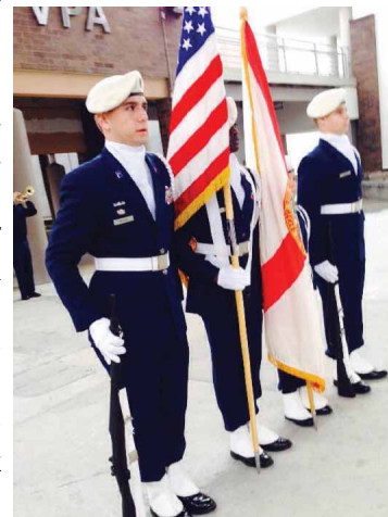
Dr. Phillips AFJROTC Honor Guard presentation of colors

The Central Florida Chapter is pleased to support the AFJROTC programs with a stipend and to attend their annual award ceremonies.