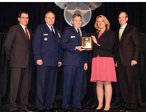
Air Force Air Battle Manager