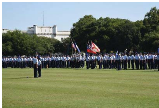
All of our cadets successfully completed the program!

The course emphasizes the hands-on team building activities so time is spent on obstacle courses,