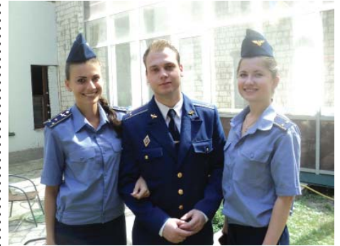
Ukrainian Air Force Officers