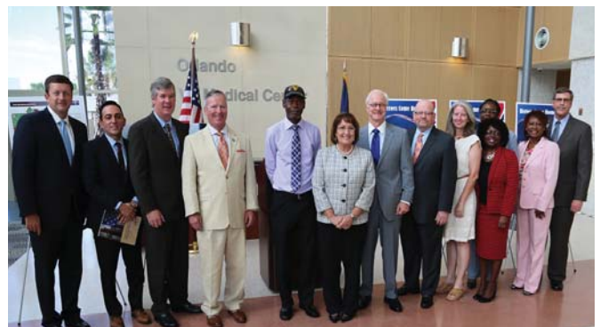
“Surge” officials meet with VA to help homeless Vets

The Surge provided an opportunity for all those concerned about homeless Veterans to help identify and work to help Veterans get off the streets. The results identified approximately 418 homeless Veterans and we are working to address the needs of those identified during the Surge.