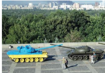
Ukrainian and Russian tank standoff at Kiev's War Memorial

authorized chaplaincy so local volunteer pastors have become chaplains for their military. With no pay, benefits, or medical care, these local pastors are serving without much training or experience in combat related ministry.