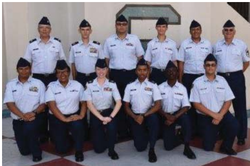
Central Florida Cadets attend Leadership Training at Citadel

Last June, Wekiva cadets engaged this highly beneficial development program for both cadre and rookie cadets.